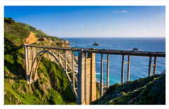
concrete road bridge