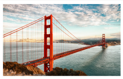
metal suspension bridge

A bridge is a structure built over a road, river or railway that allows people or vehicles to cross from one side to the other. Bridges can be built from a range of materials.