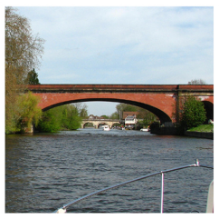
M Maidenhead Railway Bridge