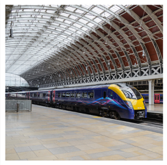
Great Western Railway