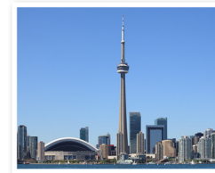
CN Tower, Toronto, Canada

A tower is a tall, narrow structure. Here are some famous towers from around the world.