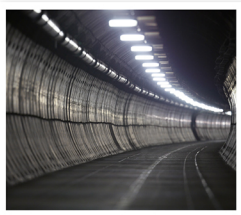
The Channel Tunnel is a tunnel under the sea that links England and France.

A tunnel is a long passage under the ground. Tunnels are usually built as a way of getting from one side of an obstacle to the other.