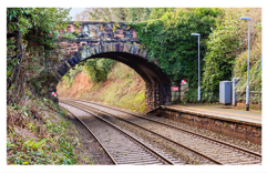
stone railway bridge