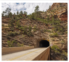
The Zion-Mount Carmel Tunnel in the USA is a tunnel through a mountain.