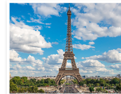
Eiffel Tower, Paris, France