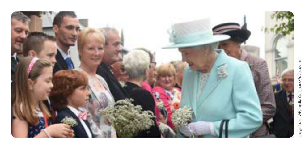
The Queen meets lots of people

Elizabeth II is the monarch of the United Kingdom. She was born in 1926 and became gueen in 1952. She was married to Prince Philip and has a large family. She lives in Buckingham Palace in London. The Queen is very important. She visits charities and schools in the United Kingdom and welcomes world leaders to Buckingham Palace.